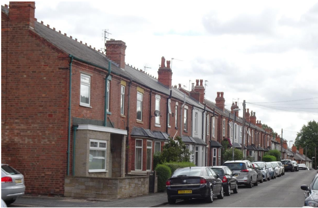
Willow Road photographed in 2020