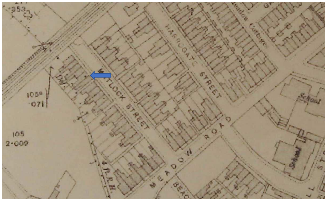
1914 Ordnance Survey Map.