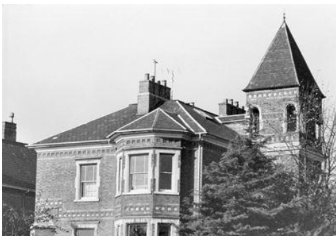
Detail of, South Road The Park