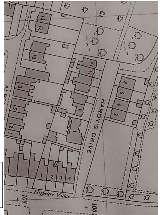
From 1953 Ordnance Survey map