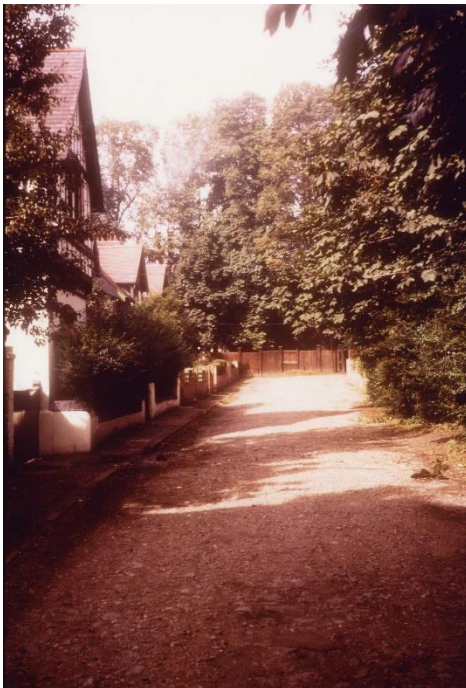
Hardy's Drive c1958

Presumably the family had moved to Gedling between 1921 and 1924. On the 1926 - 1931 Electoral Registers they are residing on Hardy's Drive.